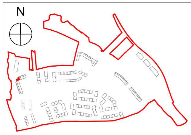
SITE KEY PLAN